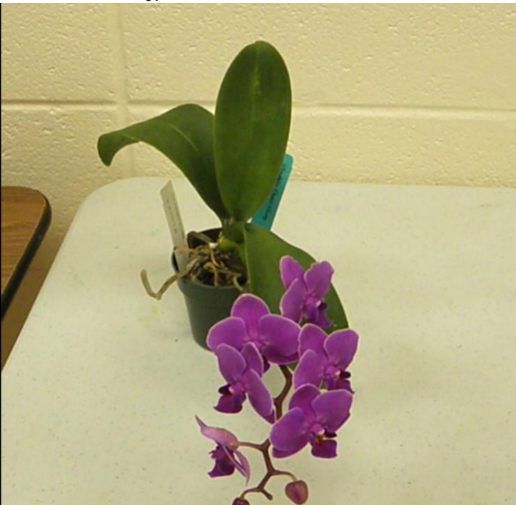
Phal. Plantation Serenade