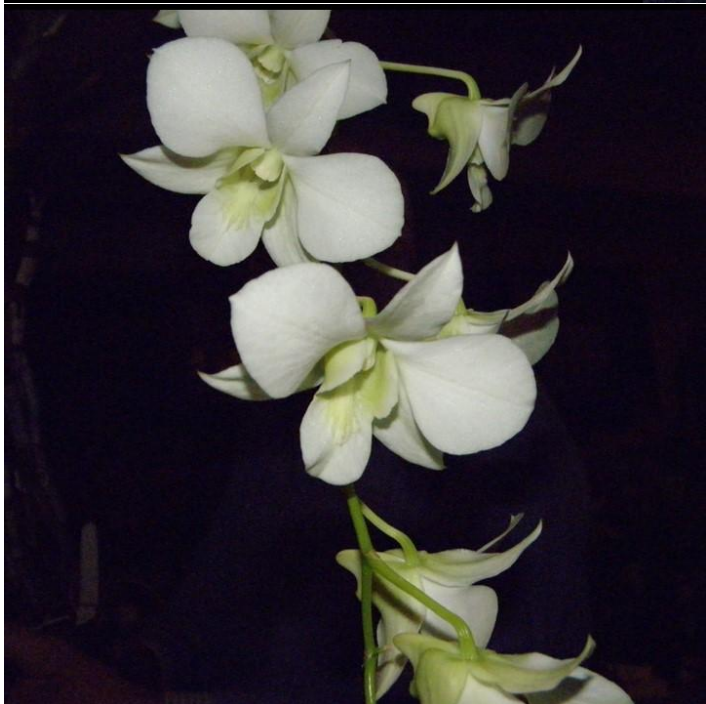
Dendrobium Patriot White Grown By George Bollenbach