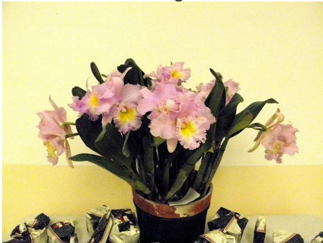
Bc. Princess Theresa "Princess Michiko"